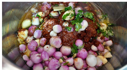
Ingredients to be saute