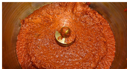
After sauteing, the ingredients are mixed and blended into chilli paste form.