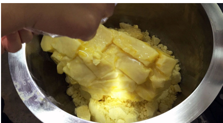
Various ingredients are added into the machine.