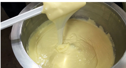
Spreadable Cream Cheese