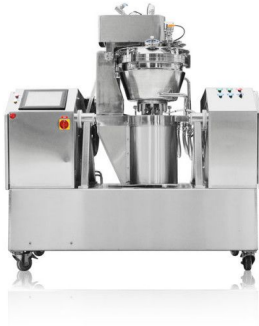
7 liters R&D model