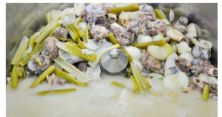
Pork Bone Soup after just 3 hours of processing, compared to traditional 12 hours.